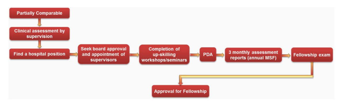
Figure 2 - Key steps of assessment for IMGs assessed as partially comparable

IMG surgeons who are deemed partially comparable will be required to complete all of the following before being eligible for Fellowship of the RACS: