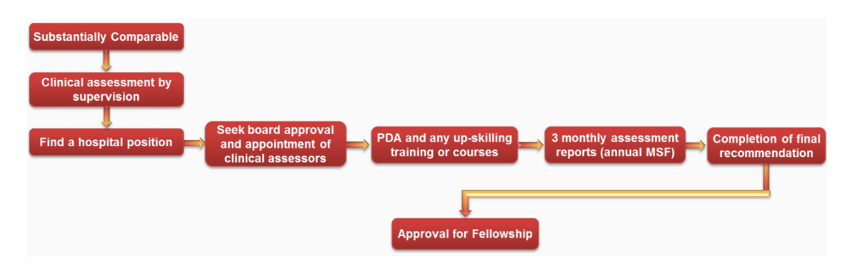
Figure 3 - Key steps for IMGs assessed as substantially comparable

The diagram below presents the key steps for IMGs assessed as substantially comparable.